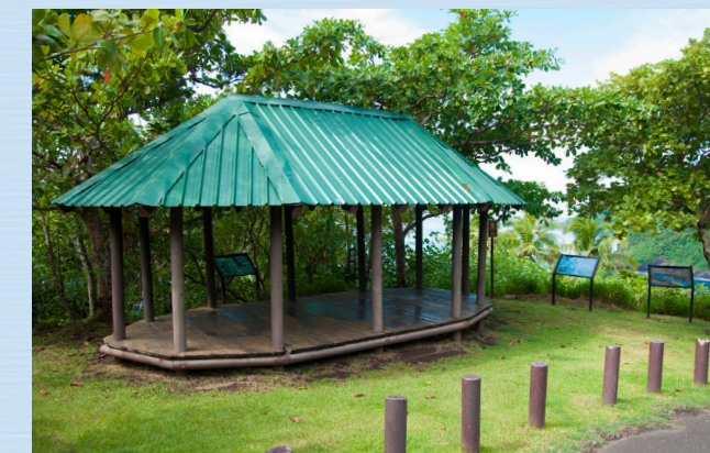
Fale at the Lower Sauma Overlook