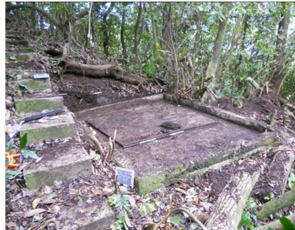
Stairs and foundation remains are among many residues of the United States Marine installations built around the guns.

more than seventy years. I knew it too, and was pleased when my bid was accepted. Subsequently, in three different sessions, my crew scoured the grounds, identifying, measuring, charting, and photographing the residues of what, during World War II, had been a major defensive installation.