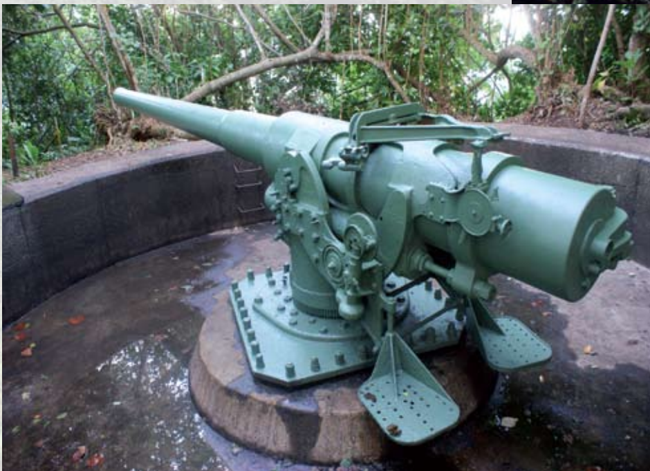
Above: View across Pago Pago harbor, American Samoa, toward Blunts Point (highlighted area): For defense during World War II, two naval guns were placed on the ridge above the point, and two more guns were similarly placed on the opposite side of the harbor entrance. Left: The "upper" Blunts Point gun after recent cleaning and repainting. The barrel is twenty-five feet long and has a six-inch bore.