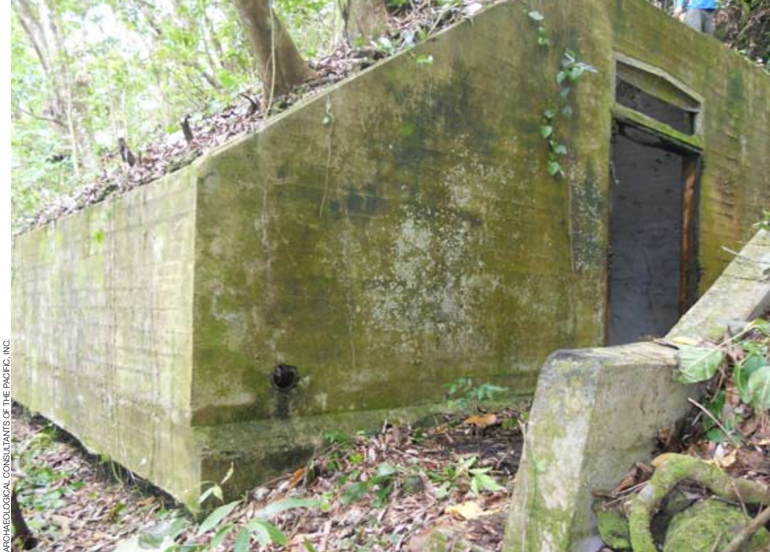
Munitions bunker at Blunts Point

Pefley launched an ambitious program that included an expansion of quarters for officers and enlisted men, the expansion and addition of storage and supply facilities, the improvement of roads, the construction of new roads, a new dispensary and new generators, more construction