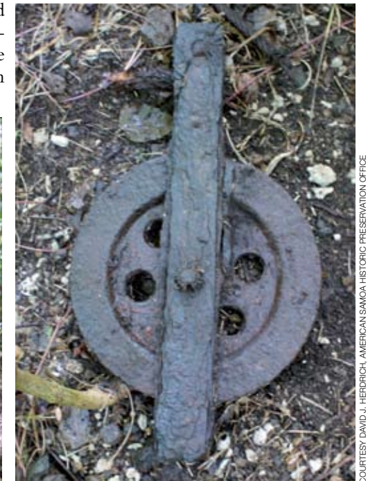
A rusted pulley played a part in hauling construction materials, weaponry, and supplies uphill.