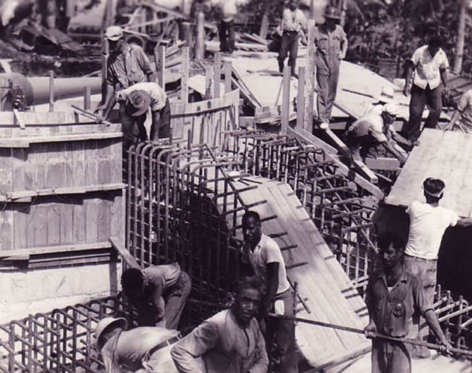
Construction of one of the gun emplacements at Breakers Point

equipment, and improved sanitation facilities. All of this was to be implemented by five large American construction firms.