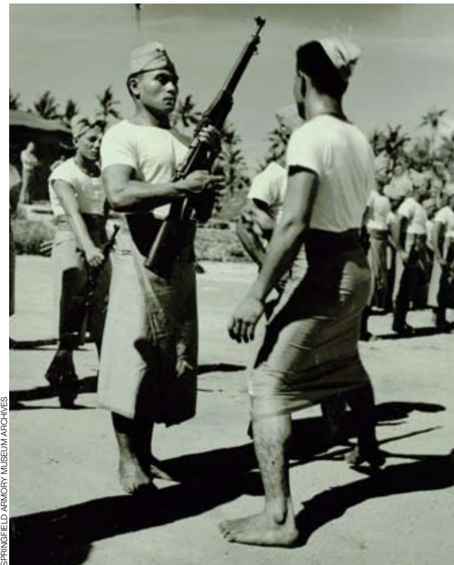
SPRINGFIELD ARMORY MUSEUM ARCHIVES

Further complications were brought into play by the hardheaded dictate that all building designs had to conform to U.S. Naval standards. Because the contractors were unable to adjust the specifications for the various structures to accommodate the locality in which they were built, the roof on the new bakery, for example, had to be designed to handle a twelve- to fourteen-foot snow load in a place where nothing heavier than a few breadfruit leaves might gather. While these changes were underway, the Chief of Naval Operations in Washington sensed that war might arrive in Samoa before the island was prepared for it. In partial response, he ordered that a Marine Defense Battalion be sent to Tutuila, and that it should arrive no later than January 15, 1941. The battalion was en route in December, but in the meantime the naval governor was authorized