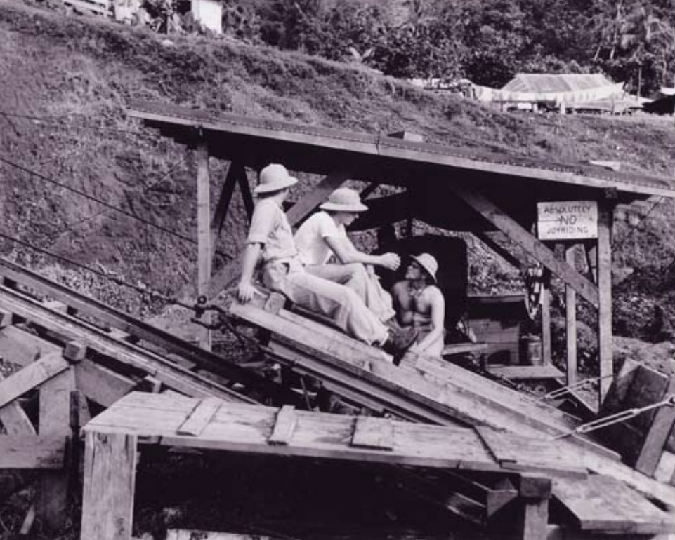
A skid, above, constructed for installation of an anti-aircraft artillery battery, warns, "Absolutely No Joyriding." Right: The cable tracks for hauling material up Blunts Point were especially steep. Bottom, opposite page: Excavation proceeds for the Blunts Point magazine, whose remains still stand, built into the hillside [see photograph on page 21].