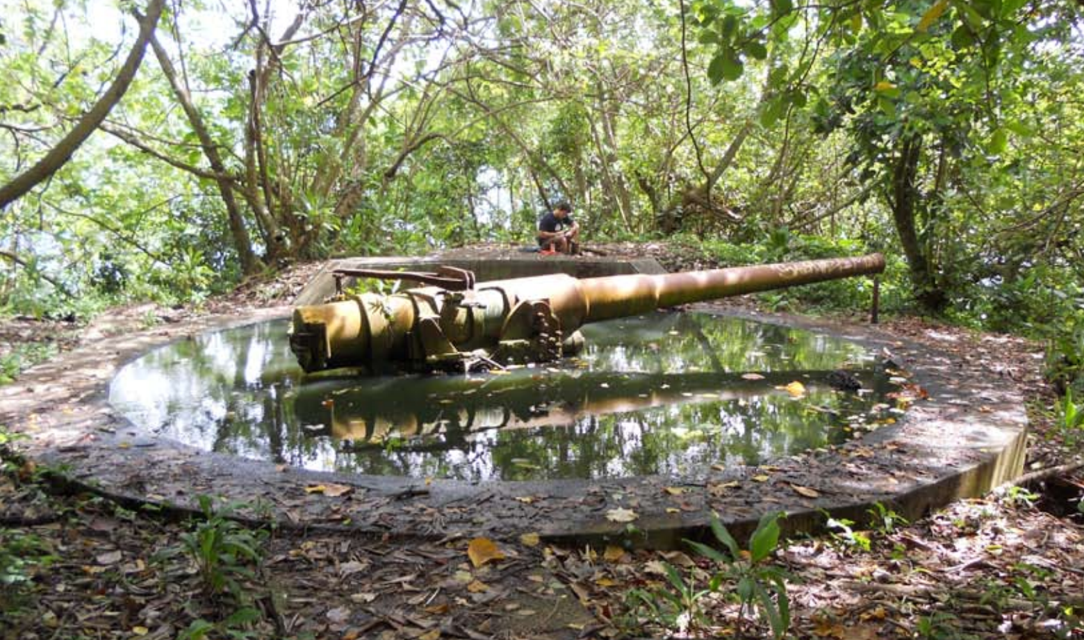
Archaeologists found the upper Blunts Point gun forgotten and rusting; the second gun, lower down the ridge, is a National Historic Landmark.

The history of those residues began in May of 1938, when Japanese military actions in the Pacific prompted Congress to direct the Secretary of the Navy to conduct an assessment of the strategic importance and state of readiness of United States naval bases in the Pacific. In 1939, the War Plans Section of the U.S. Marine Corps prepared a specific report on the defenses of American Samoa, with a focus on U.S. Naval Station Tutuila—a place that had been under shaky American jurisdiction since 1900.