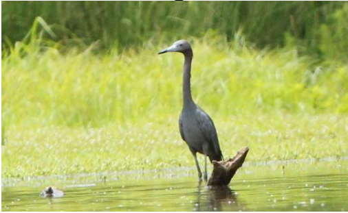
Little Blue Heron ( Egretta caerulea ) Male: dark blue with black-tipped bill Female: same as male Juvenile: white with black-tipped bill