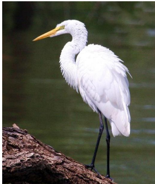
Great Egret ( Ardea alba ) Male: tall, all white with yellow bill and black legs Female: same as male Juvenile: same as adult