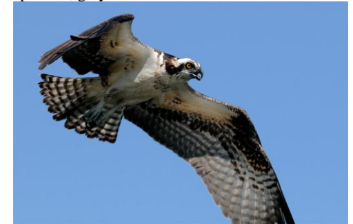
Osprey ( Pandion haliaetus ) Male: white breast and belly, black back and black streak through eyes Female: same as male but slightly larger Juvenile: similar to adult with light tan breast