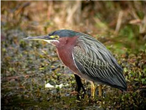
Green Heron ( Butorides virescens ) Male: short and stocky body build, grey-green back, dark red breast, dark green crest Female: same as male Juvenile: similar to adult with white streaks on chest and neck