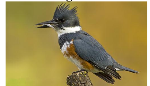
Belted Kingfisher ( Ceryle alcyon ) Male: blue with white belly and blue breast band, long black bill Female: similar to male but with red breast band in addition to blue Juvenile: same as female