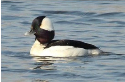
Bufflehead ( Bucephala albeola )

Male: black head and back with white belly and patch on back of head