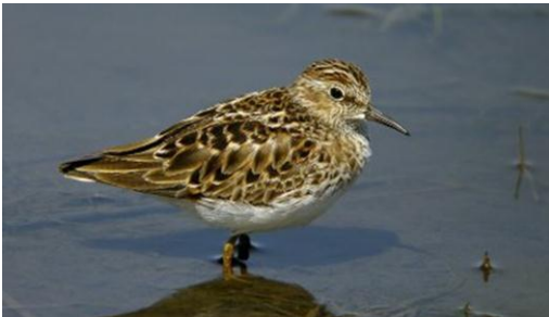
Least Sandpiper ( Calidris minutilla ) Male: golden-brown head and back, white breast and belly Female: same as male Juvenile: same as adult