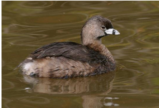
Pied-billed Grebe ( Podilymbus podiceps )

Male: brown with black ring around thick white bill