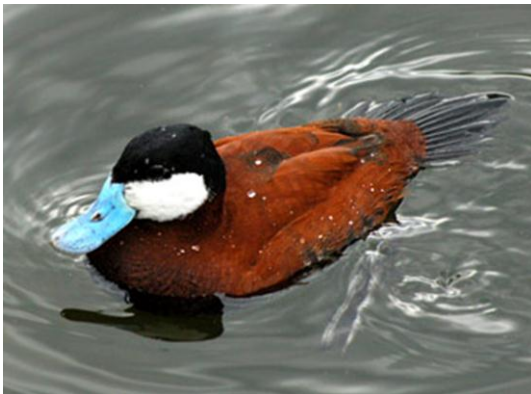
Ruddy Duck ( Oxyura jamaicensis )

Male: small with blue bill, black head and white face