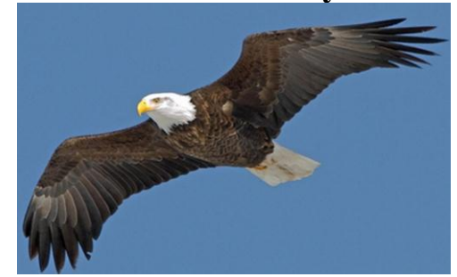
Bald Eagle ( Haliaeetus leucocephalus ) Male: dark brown to black with white head and tail, yellow bill Female: same as male but slightly larger Juvenile: dark brown with white spots or speckles, grey bill