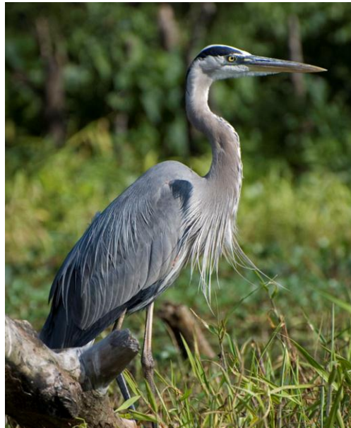
Great Blue Heron ( Ardea herodias ) Male: tall and grey, with black band on head extending to black plumes, long yellow bill Female: same as male Juvenile: similar to adult but more brown than grey, no plumes