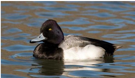
Lesser Scaup ( Aythya affinis )

Male: black with white sides, blue bill, yellow eyes