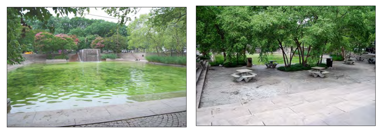
FIGURE 4: PERSHING PARK

Opportunities — Improvements and more activities could bring this park area to life.