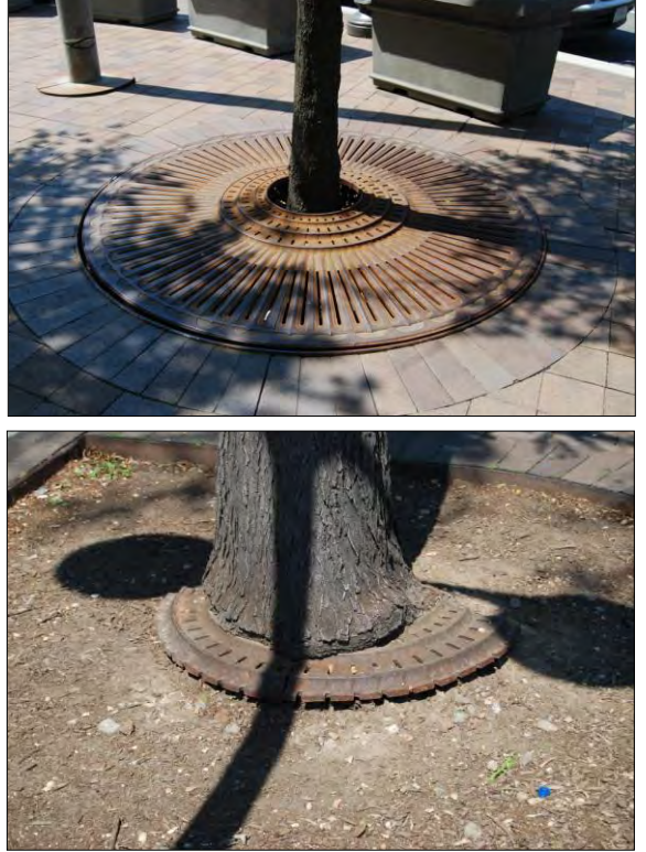
PADC had custom tree grates designed for the avenue; however, as the trees grew, the openings were not enlarged, resulting in the trees growing into the grates. In the worst cases trees have been girdled and died.