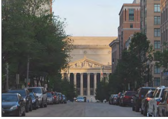
The view through the U.S. Navy Memorial is of the National Portrait Gallery to the north and the National Archives to the south, an important secondary view of the L'Enfant Plan.

Street, and skateboard damage is evident on walls and commemorative features.