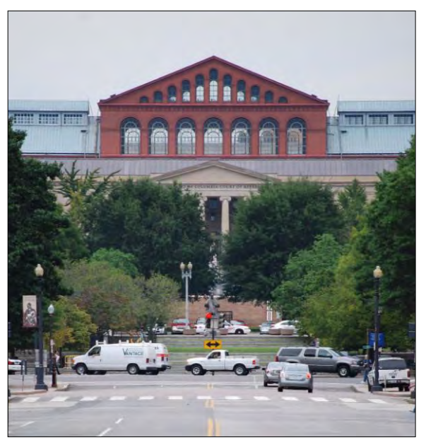
The view from the National Mall north along 4th Street through John Marshall Park to the National Building Museum is an important element of the L'Enfant Plan.