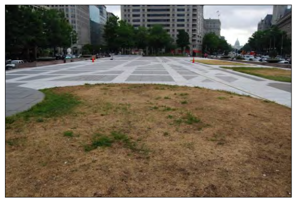
The large paved area illustrates L'Enfant's plan for the city. It is frequently used by skateboarders, and few amenities are provided for casual visitors.

Opportunities — With the GSA selection of Trump Old Post Office, LLC, as the developer for a hotel and retail in this location, new approaches to improve visitor experiences will be created, including sidewalk cafés. The building will be more accessible as barriers to access are removed.