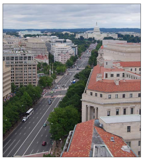
Pennsylvania Avenue from the top of the Old Post Office tower.

When Pennsylvania Avenue was transferred to NPS in 1996, it became a unit of the national