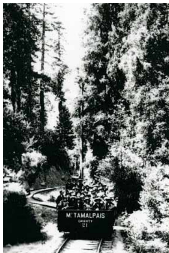
Visitors riding a gravity car to Muir Woods