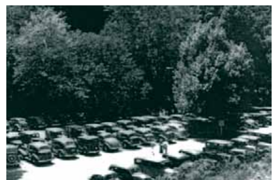
Automobiles parked in what is now the main parking lot (c. 1933).

People today still experience the same sense of excitement at the prospect of getting out of the city and coming to Mount Tamalpais for exploration and recreation. Hikers and bicyclists now enjoy the Old Railroad Grade and Gravity Car Road as popular paths. Restored gravity cars are on display at the Gravity Car Barn at the summit of Mount Tamalpais and at Old Mill Park in Mill Valley. A locomotive from the old rail line rests at the entrance to the Pacific Lumber mill in Scotia, California. These relics are all that remain of the era of railroad travel to Muir Woods. Visitors today may not experience an exciting ride on a gravity car as they enter the forest, but traversing mountain roads to admire the majesty of redwood trees will always be a part of visiting Muir Woods National Monument.