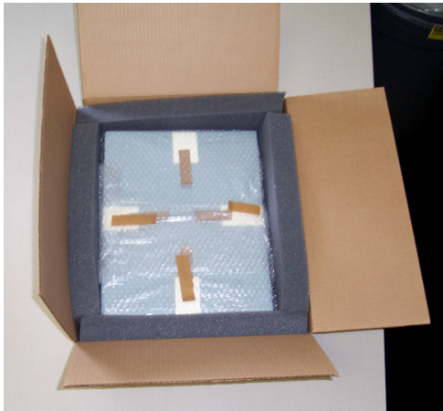
Figure 7. Prepared frame in inner box.

the box with 2” of urethane foam on all four sides and bottom. If there are void areas, fill with additional urethane foam and place a sheet of foam on top. Tape the flaps of the box closed.