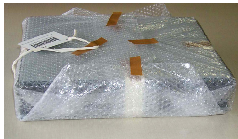
Figure 6. Tape an identification tag on top of the bubble wrap.