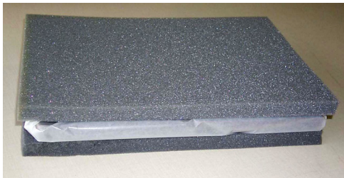
Figure 3. Sandwich the glassine-wrapped frame between urethane foam.