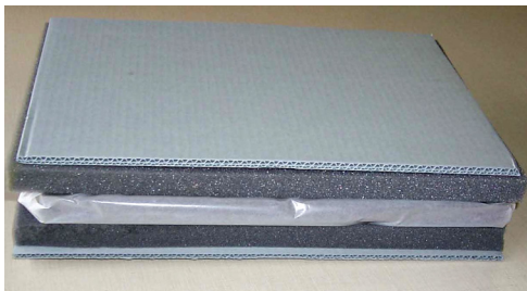
Figure 4. Sandwich the foam package between two layers of multi-use corrugated board.