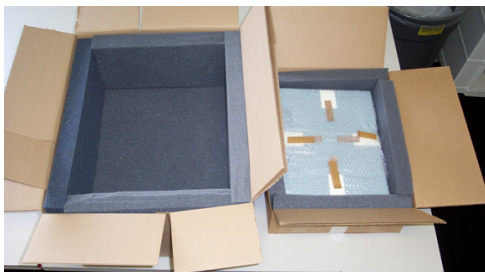
Figure 8. Outer box prepared to receive inner box.