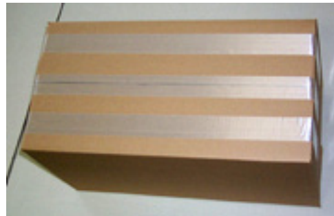
Figure 10. Adhere with three pieces of tape across the top of the box.