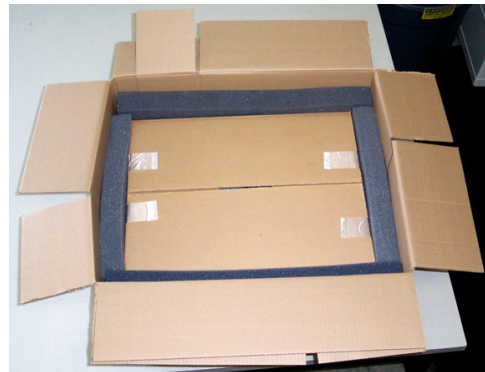
Figure 9. Double box the framed object.