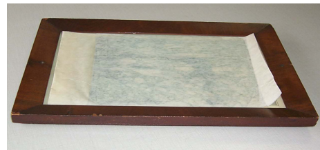
Figure 1. Taping the glazing.