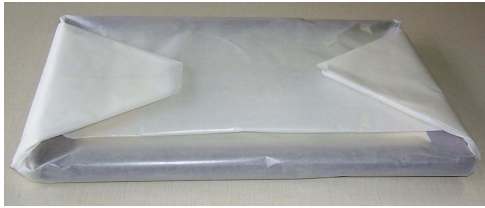
Figure 2. Wrap the frame in glassine.