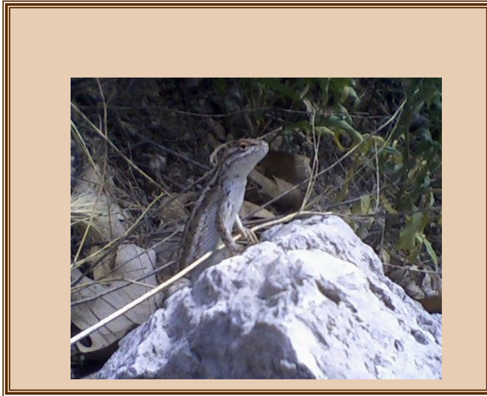
Plateau Lizard ( Sceloporus tristichus ) basking in the sun on a rock. Photo taken at Montezuma Well National Monument by Ranger Sharlot Hart.