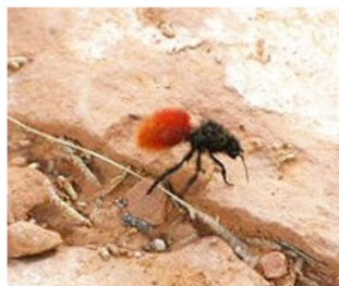
Red Velvet Ant ( Dasyneutilla magnifica )

The Red Velvet Ant isn't really an ant at all! It is actually a species of primitive wasp without wings! The females of this species are the ones frequently seen foraging on the ground for insects while the males have wings and are flying around foraging for nectar. Take care to leave these ladies on the ground alone, because their sting is definitely worse than their bite!