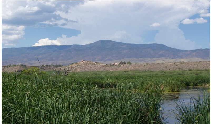
A view of the ruins at Tuzigoot National Monument from Tavasci Marsh.

Ten thousand years ago the Verde River did not flow in the same course it does today. Back then the river meandered around the hill which would later support the pueblo structure which we call Tuzigoot. This oxbow formation included the Tavasci Marsh area. When the water of the Verde River finally succeeded in cutting through the isthmus of land connecting the hill of Tuzigoot to the hill to the south, the river took the shortcut and the meander was abandoned. But the marsh had its own springs, and stayed wet,