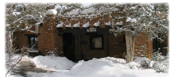
Chapin Mesa Archeological Museum

Chapin Mesa Archeological Museum and Store will help you gain insights into the lives of the Ancestral Pueblo people. The museum is located 20 miles (33 km) south of the park entrance. A 25-minute park video is shown every half hour or upon request. Open daily except Thanksgiving, Christmas, and New Year's Day.