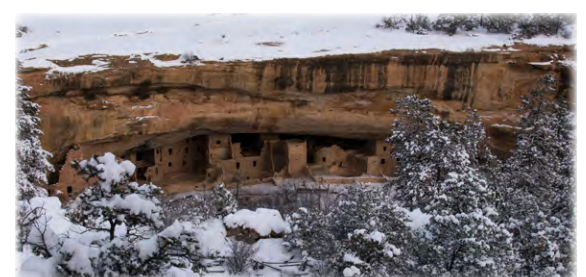
Spruce Tree House from overlook

*It is a 45- to 60-minute drive from the park entrance to Spruce Tree House and the museum.