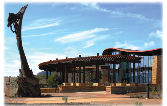
Welcome Plaza, Mesa Verde Visitor and Research Center

*Please stop by the the Visitor and Research Center to pay your entrance fee and support your parks.