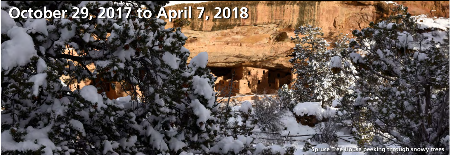
Spruce Tree House peeking through snowy trees