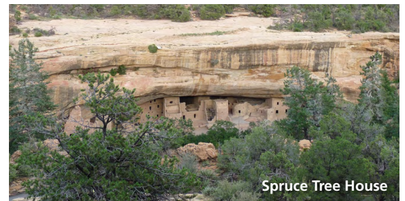
Spruce Tree House

A ranger is at the overlook daily to answer questions and share information about Spruce Tree House and the Ancestral Pueblo people who once lived there. Ask a ranger at the museum for hours.