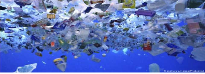
A plastic 'garbage patch' in the ocean.