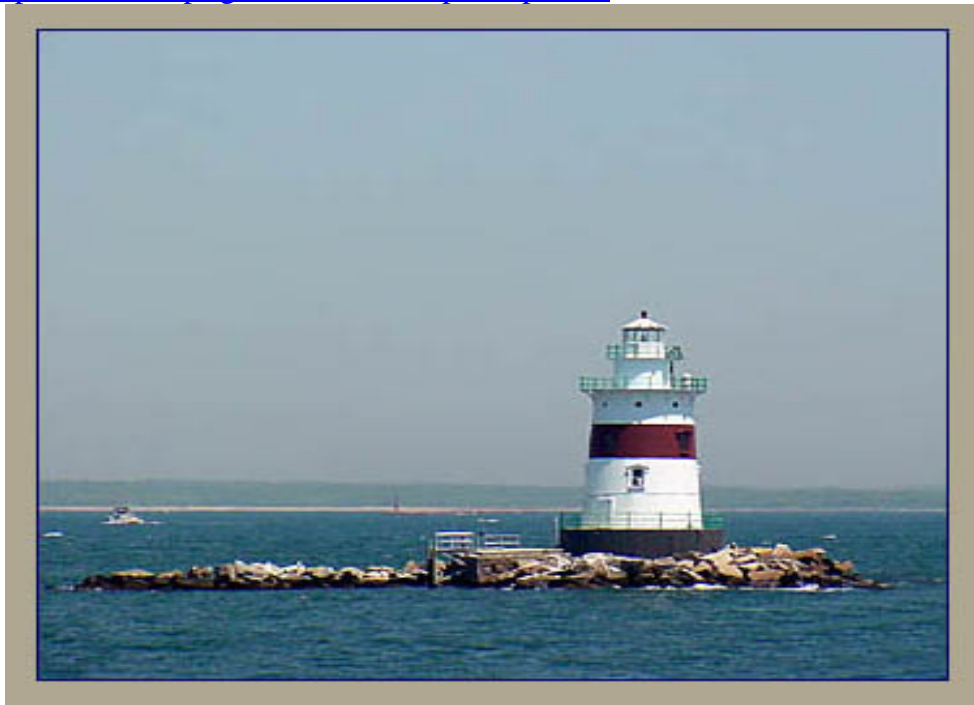
Latimer Reef Light Station, Fisher's Island Sound, NY

For information on the National Historic Lighthouse Preservation Act program, please visit http://www.cr.nps.gov/maritime/nhlpa/nhlpa.htm .