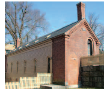
The restoration of the Francis Gatehouse complex is dramatic as it recaptures its historic appearance—new windows at the hydraulic gatehouse provide great interior light to a building that had been in the dark for at least fifty years.

Next phases of the project include: design and construction of the Riverwalk between Boott Mills and the Lowell Memorial Auditorium; Canalway development along two sections of the Western Canal; and a walkway from Pawtucket Street to the Pawtucket Gatehouse at the River and Northern Canal Walkway. Each phase of progress is also rooted in partnerships with private and community groups including the Lowell Parks and Conservation Trust, Boott Mills Development, and resident advocacy groups. As important as it is, design phases tend to be invisible elements of projects and deserve acknowledgement. Currently, design plans are underway for the Hamilton Canal Walkway, Western Canal Area 2 and 3, the Upper Pawtucket Canalway, and the Pawtucket Falls Overlook projects.