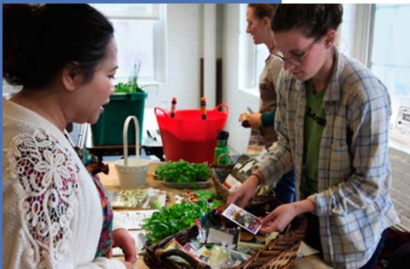
Left: Growing green at the LoWELLness Festival.