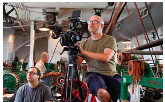
Right: Popping up in the community. Orientation filming sees Mill Girls return to the weaverroom.