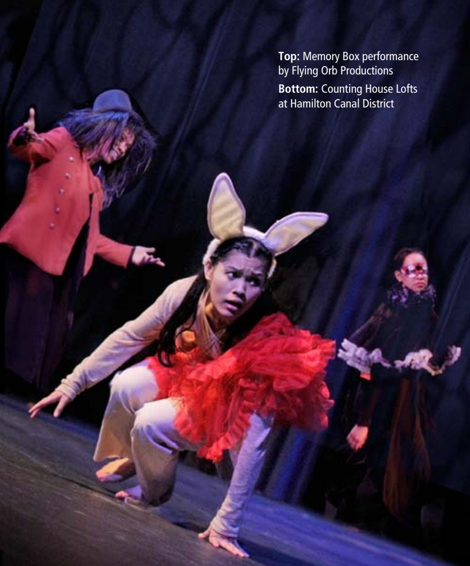
Top: Memory Box performance by Flying Orb Productions