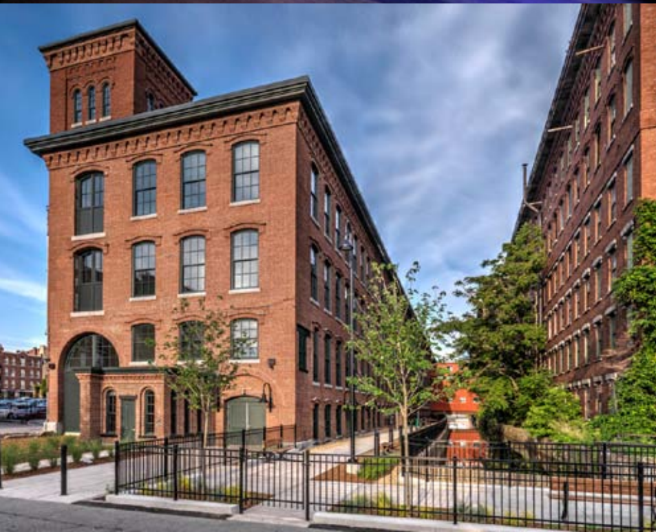
Bottom: Counting House Lofts at Hamilton Canal District