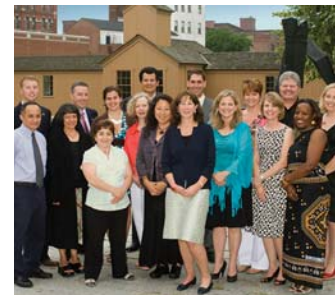
Above, top: Public Matters 2009 rafting on the Concord River (Photo by Zoar Outdoor). Above, bottom: Members at the program's concluding session in June. (Photo by Megpix Photography).