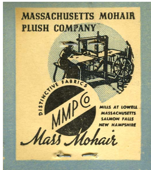
Cover illustration: Sample of Fabric "Arlington" with memo re: its production, 15 December 1954, Massachusetts Mohair Plush Records, Box 4, Folder 1. Above: Detail of label on the "Arlington" sample.