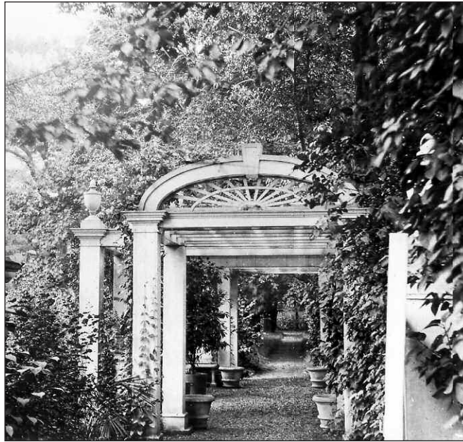
Looking south through the arbor in the garden at the Longfellow House.