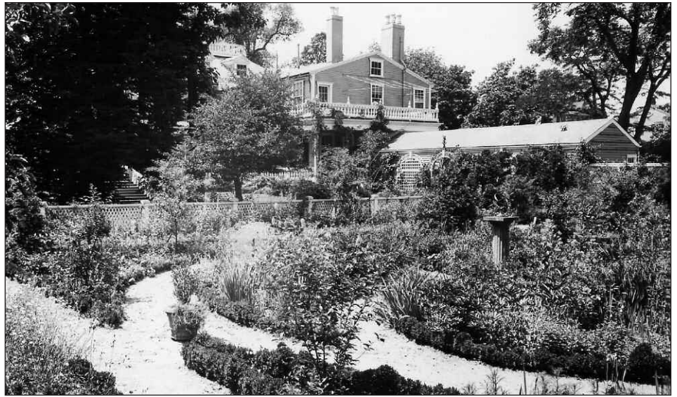
Garden (near ell) looking southwest, 1940.