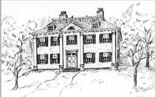
Longfellow House as it looked in 1775, drawing by Edie Bowers for Frances Ackerly's slide show

but felt there was little information and no collection of images from this period. She researched life in the House during this time, its residents and visitors, and simultaneously gathered visual material to make this period