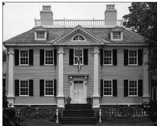
The 1759 section of the Vassall-Craigie-Longfellow House

This coming summer during its annual Cambridge Discovery Days, the Historic