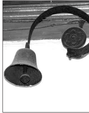
Servant bell in the kitchen

Studying the servants' bells provides insight into the lives of the lesser-known occupants of 105 Brattle Street in those days. "The location of the bells in the kitchen and pantry indicates that servants would be expected to spend their time in those rooms unless engaged in specific tasks elsewhere," said Hopkins. That the Longfellows chose to request service with bells rather than shouting connotes "expectations for gentility and the tranquility of domestic space," Hopkins deduced.