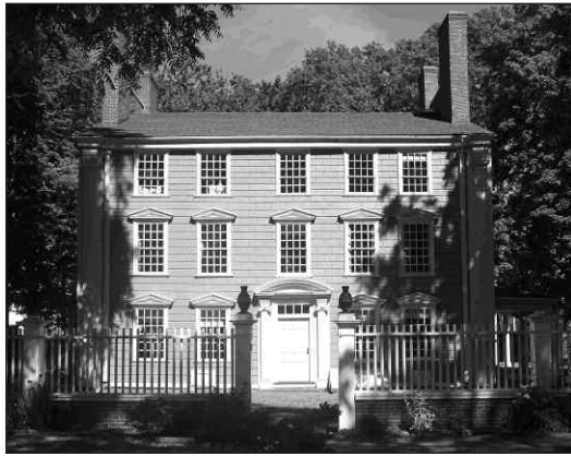
Royall House, Medford, with facade remodeled in 1747