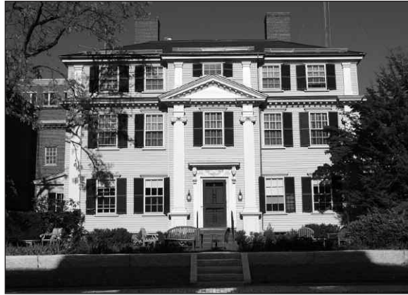
Apthorp House, Cambridge, built in 1760 possibly by Peter Harrison

Apthorp House (built for minister East Apthorp) and the Longfellow (Vassall) House. He based this on the importance and activity of Harrison in Boston and Cambridge and on the use on both of these houses of Palladian features associated