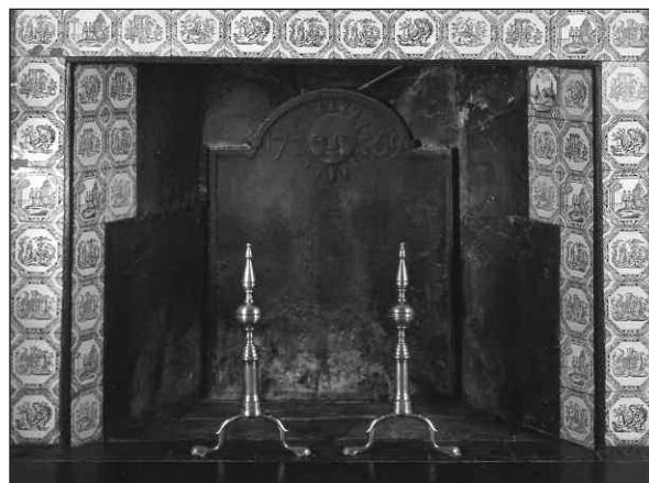
Iron fireback in the second floor bedroom, showing date of 1759