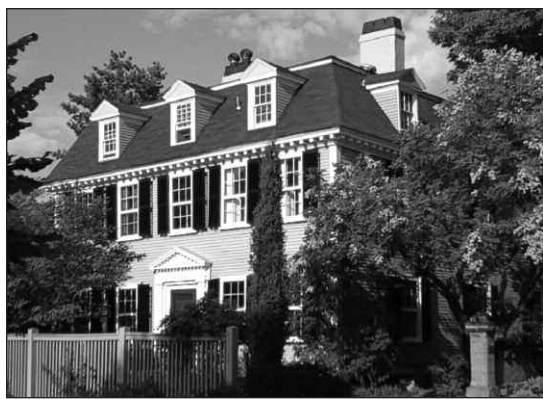
Henry Vassall House, 94 Brattle Street, Cambridge