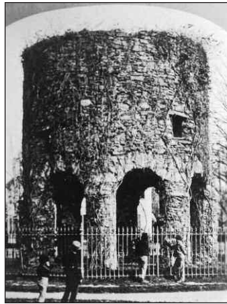
Old Stone Mill, Newport, R. I.