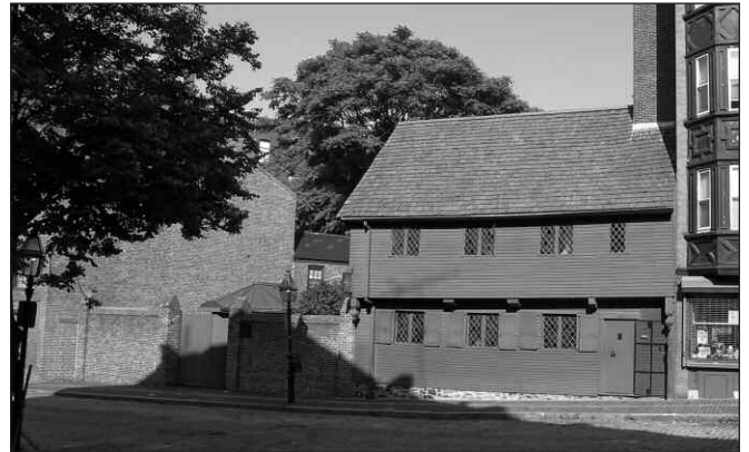
The Paul Revere House as it was restored in 1908 and remains today

On North Square in Boston's North End, the wooden building now known as the Paul Revere House has survived numerous transformations. Between 1676 and 1681, a wealthy merchant built it as a two-story colonial residence with a second-floor overhang. In the mid-eighteenth century the roofline was