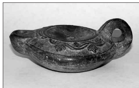
Ancient Roman earthenware oil lamp in the exhibit