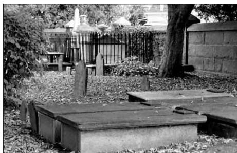
Jewish Cemetery at Newport, Rhode Island, 2007