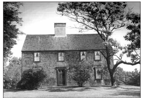
John Alden House, Duxbury, Massachusetts, c. 1960

As part of the "Big Read," the National Endowment for the Arts in partnership with the Poetry Foundation published in February a Readers Guide and a Teacher's Guide, The Poetry of Henry Wadsworth Longfellow . Longfellow is the first poet in America to be recognized for this nationwide program.