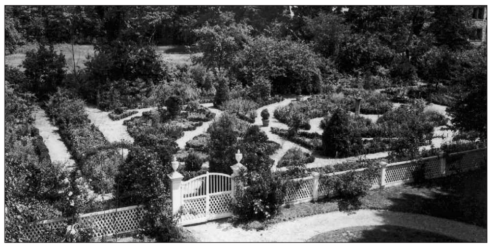
Aerial view of the Longfellow House formal garden, 1935

Martha Brookes Hutcheson wrote in a letter in response to the Historic American Building Survey in 1936, "The Longfellow Garden at Cambridge I overhauled entirely. It had gone to rack and ruin. I reset box in the Persian pattern which the poet had