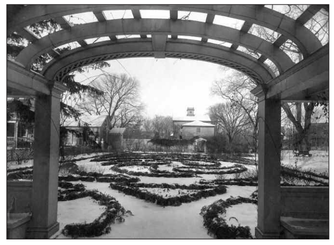
Looking through the pergola towards the carriage house, 1905

Visitors to the newly renovated formal garden will notice the most dramatic changes. Perhaps most striking, the missing Colonial Revival pergola, designed by the landscape architect Martha Brookes Hutcheson, has been reproduced and once again provides not only a focal point but also a private and shady spot, a "resting