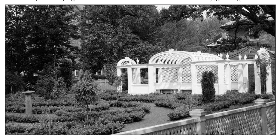
The rehabilitated pergola in the formal garden, 2005

"One of the exciting things to come from the campaign was to hear other people's ideas about future uses of the garden for educational and public purposes," Nash recalled. "The ways in which the public will continue to support this 'new dimension' to the House will keep growing."