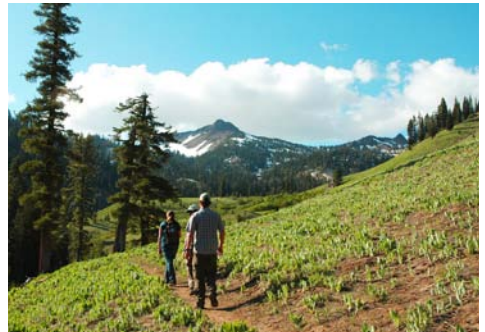
The trail affords excellent views of Mt. Diller