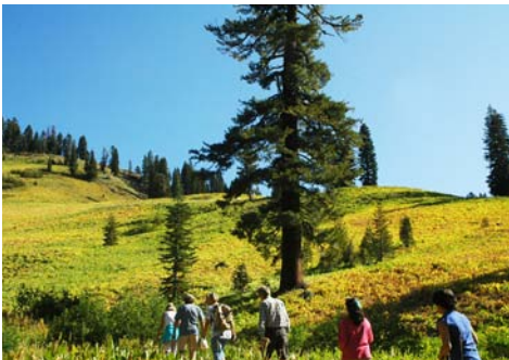
Hikers pass through mule ears wildflower fall color

Closest emergency phone is at the Kohm Yah-mah-nee Visitor Center.