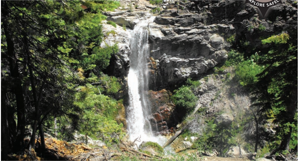
Mill Creek Falls tumbles nearly 100 feet