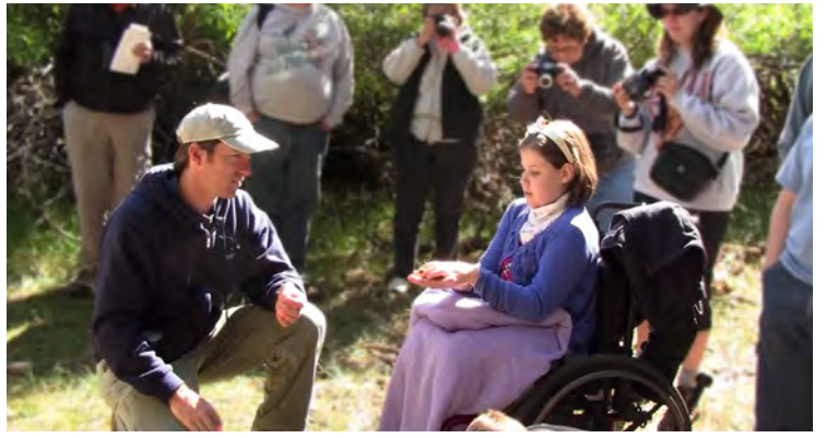
A young girl releases a yellow warbler at a bird banding demonstration