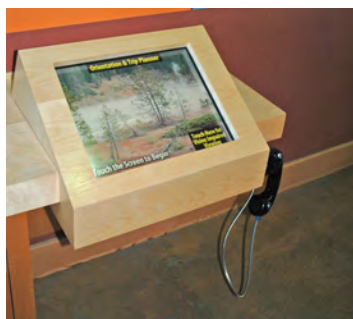
Interactive trip planning display

Lassen has several picnic areas in which to enjoy an afternoon in the park. Manzanita Lake, Lake Helen, Devastated Area, and Kings Creek picnic areas offer level sites, accessible restrooms, and accessible parking.