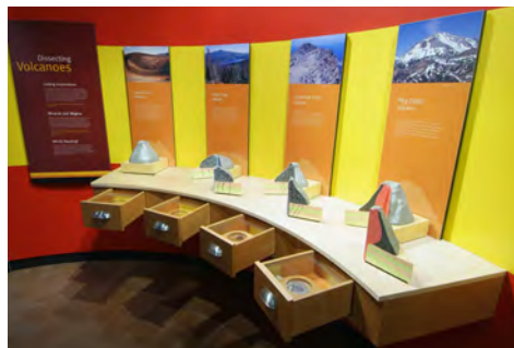
Tactile volcano model exhibit