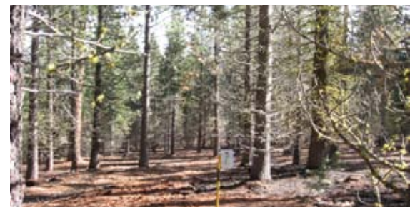
Manzanita Lake Campground area after restoration