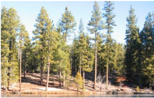
Forest stand with varied forest structure and species diversity