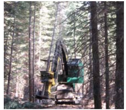
A feller buncher cuts live fuel