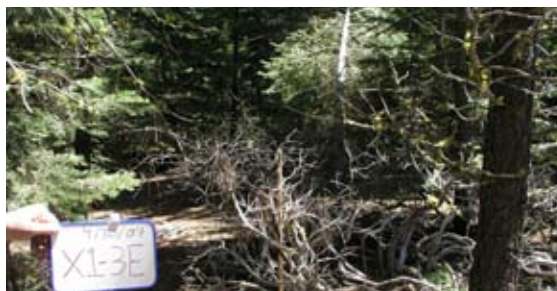
Manzanita Lake Campground area before restoration

A onetime entry with mechanized equipment will be used to reduce live understory and ladder fuels. These activities will specifically focus on the reduction of excessive understory tree densities and surface fuel loads previously managed with prescribed fire.