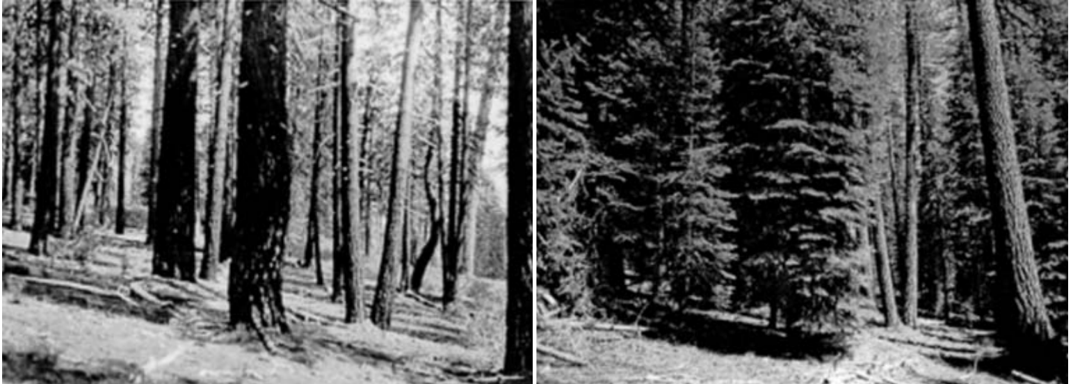
In the absence of fire, white fir has formed dense thickets in the northwest corner of the park. View in 1925 (left), same view in 1995 (right).