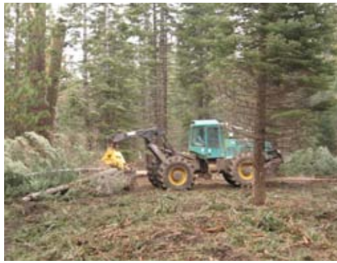
Grapple skidder removes fuels