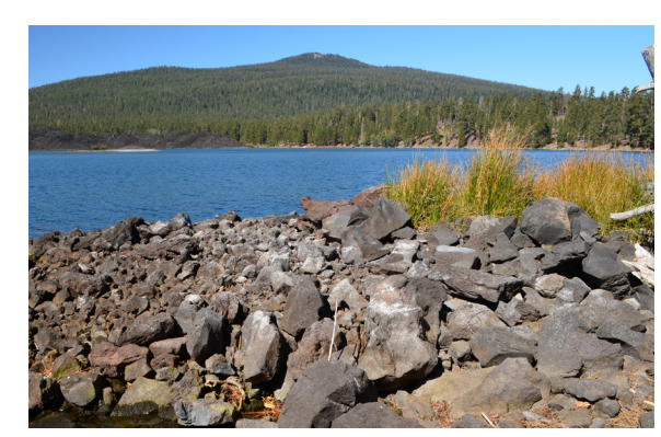
Shield volcanoes have a low profile, like Prospect Peak pictured above. Multiple shield volcanoes can give the illusion of rolling hills.

Shield volcanoes are formed almost entirely of fluid lava that builds up gradually from thousands of lava flows—like layers of paint on a canvas. The build up creates a broad, gentle sloping cone with a profile like a viking shield—hence the name. The highly fluid lava flows, known as basalt lava, spread out over wide areas, then cool as thin, gently dipping sheets. The largest known volcanoes are shield volcanoes and include such famous examples as Mauna Loa volcano in Hawaii and the largest mountain in the solar system—Olympus Mons on Mars.