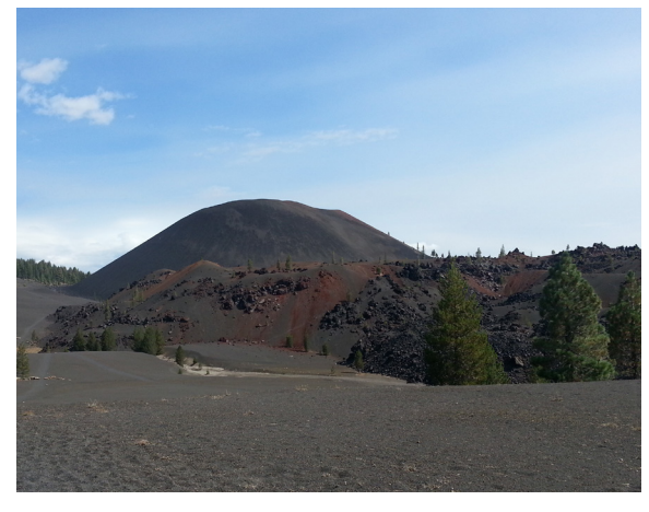
Cinders are very light in weight and shift easily under pressure when walked on.

Cinder cone volcanoes are built by gasous lava particles violently ejected high into the air from a single vent, similar to a popcorn popper. The lava shatters into small fragments that solidify in the air and fall as cinders around the vent. As the cinders accumulate, they pile up to form a circular or oval shaped cone. Cinders, more properly known as scoria, are made of a low density basalt that has a bubbly or vesicular texture. As the lava cools quickly in the air, gases are trapped within the rock, creating this texture. Most cinder cone volcanoes have bowl shaped craters at the summit and lava flows are commonly emited from their bases.