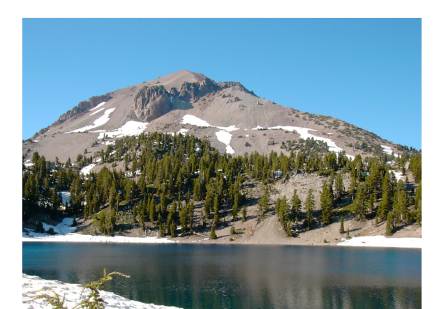
Lassen Peak is considered the most likely volcano in the Cascade Range to erupt in the coming century.

Plug dome volcanoes are formed by nonexplosive outpourings of viscous lava that piles up around a vent, but can be preceded or followed by explosive eruptions. Domes commonly occur within a crater or along the flanks of larger composite volcanoes. Growth occurs largely from within by expansion of lava that is too thick to flow. As it grows, the outer surface cools and hardens, then shatters, spilling lose fragments down its sides. At 10,457 ft (3187 m), Lassen Peak is one of the largest plug dome volcanoes on earth. A smaller dome formed inside Lassen's crater. During its last eruption, a large explosion shattered the dome causing hot blocks of lava to fall from the peak, creating the Devastated Area.