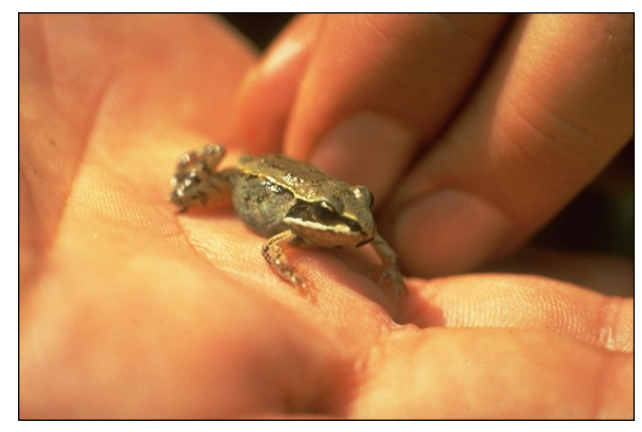
Wood frog – Rana sylvatica.

Through interpretation, park staff facilitate public understanding, appreciation, and protection of fish, wildlife, habitats, and management of diverse northwest Alaska ecosystems.