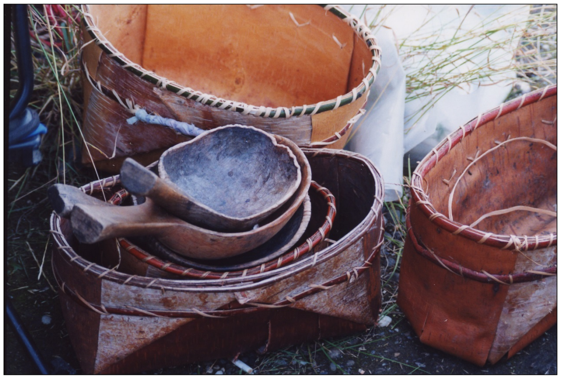
Birch bark baskets are a traditional craft of the Kobuk River region.