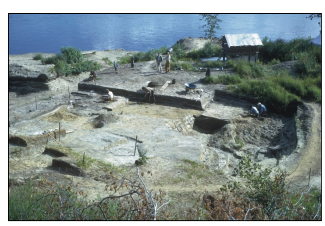
An archeological excavation at Onion Portage.

Staff and researchers facilitate development of educational materials for a wide range of audiences, highlighting aspects of the natural and cultural history of the park.