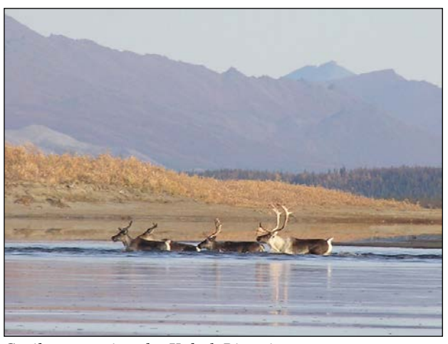
Caribou crossing the Kobuk River in autumn.

Park staff will facilitate public understanding, appreciation, and protection of the environmental elements that affect the caribou migration.