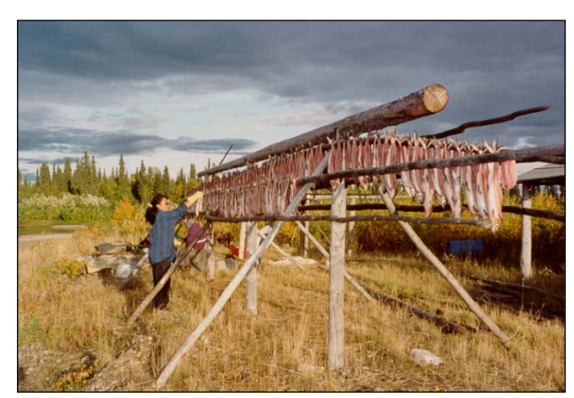
Drying whitefish along the Kobuk River.

The park staff facilitates the public understanding, appreciation, and protection of subsistence resources and the management and use of those resources.