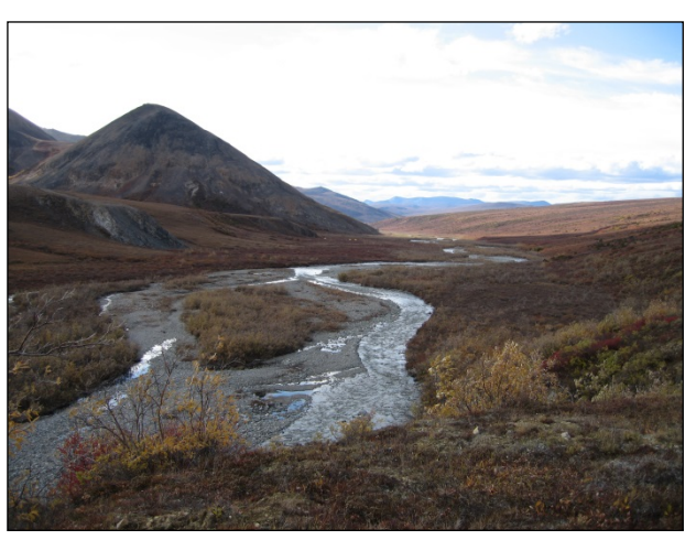
The upper Salmon River, a designated Wild River.

Park Staff will facilitate public understanding, appreciation, and protection of wilderness values and physical features.