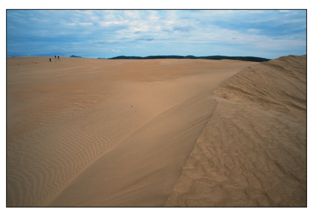
The Great Kobuk Sand Dunes.

Park staff facilitates public understanding, appreciation, and protection of all the elements of the ecosystem.