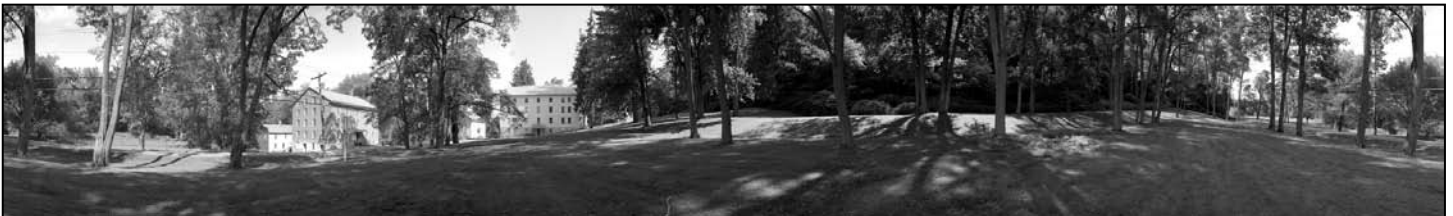
North Family, Mount Lebanon Shaker Village, HALS NY-7

https://www.nps.gov/TPS/how-to-preserve/briefs/36-cultural-landscapes.htm