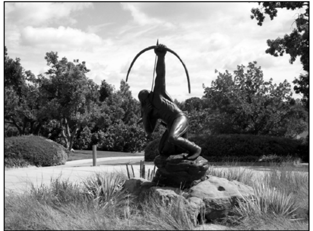
Thomas Gilcrease Estate, HALS OK-25