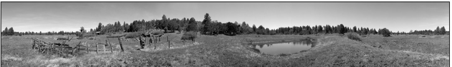
Pine Ranch, Grand Canyon-Parashant National Monument, HALS AZ-4