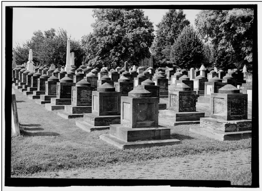
Congressional Cemetery, HALS DC-1-10

Archival standards for the basic durability performance of photographic materials for HALS documentation materials are 500 years. Large format black and white photography when processed to archival standards is believed to meet this standard, while color photography does not. Small and medium format photography is maintained in the HALS collections as part of the field records. The HALS office reserves the right to refuse documentation that does not meet archival requirements for photographic materials. Digital photography is not considered archival at this time. Completed Release and Assignment Form(s) must accompany all donated HALS photographs.