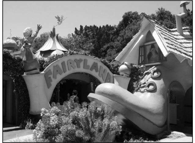
Children's Fairyland, HALS CA-19

I encourage everyone to prepare HALS documentation for sites in your community or state. Since 2004, I've been actively engaged in doing HALS documentation. What I most enjoy is getting up on a Saturday morning, picking a site to visit in my community, packing a picnic lunch, and off we go. I record my notes and photograph the site, then on Sunday do some research, and write up a short form. I find this greatly enhances my experience of the site and it feels good to know I am contributing to a permanent record of our nation's cultural landscape heritage. I encourage everyone to take the challenge and document a site in your community or state - it can be great fun and very satisfying. One way to get started is by preparing an inventory of sites, potential candidates for HALS documentation in your state or region.