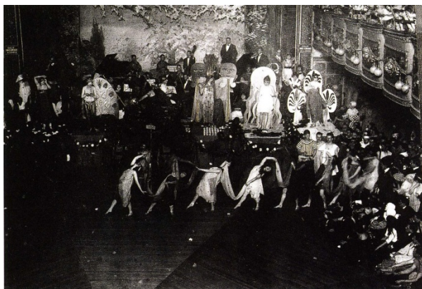
1920s Drag Ball at Webster Hall, New York City.