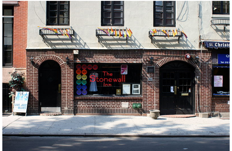
The Stonewall Inn, New York City; a National Historic Landmark.

Nominate a Place. Many places of local, state, and national significance to LGBTQ history are not yet listed in the National Register of Historic Places, the nation's list of places considered worthy of preservation. Find out how to get started with the National Register Fundamentals. You can find out about available grants and other assistance from your State Historic Preservation Office (SHPO) or Tribal Historic Preservation Office (THPO).