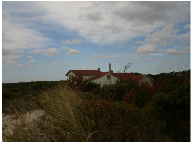
Carrington House, Cherry Grove, Fire Island, NY. On the National Register of Historic Places.

Share Your Knowledge and Ideas. Write an article or opinion piece for your local newspaper, blog, social media, and other outlets. Please share them with us!