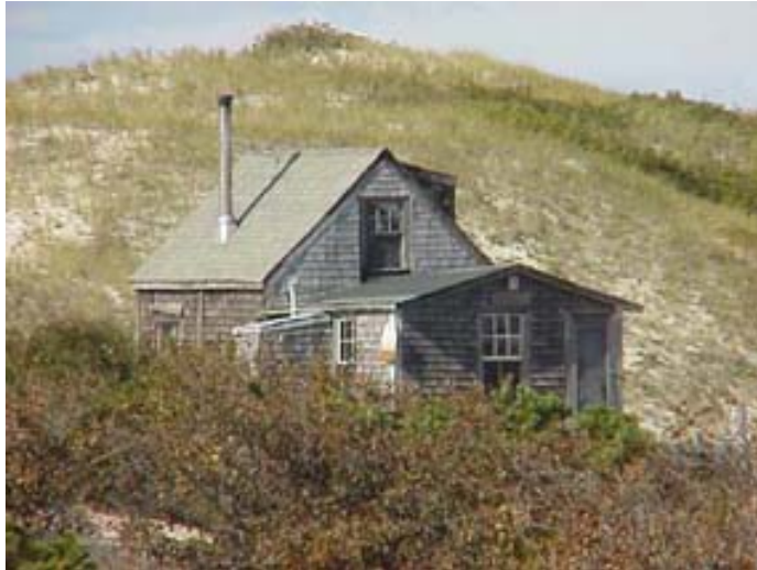
C-Scape shack, within the Dune Shacks of the Peaked Hill Bars Historic District (on the National Register of Historic Places), Cape Cod National Seashore, MA. See the Cape Cod National Seashore website for information on the Residency program for these dune shacks.

Advocate for Endangered Places. There are many ways to advocate for endangered LGBTQ places, including many described in this document. In addition, the National Trust for Historic Preservation works to preserve and protect historic places across the country. Check out their website for ways to help fight for places significant to LGBTQ history.