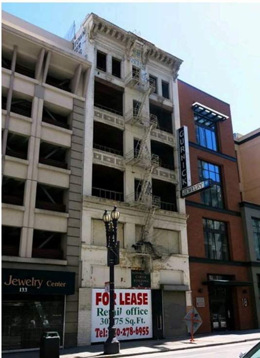
165 O'Farrell St. in San Francisco, CA: The office of the Daughters of Bilitis, the first lesbian organization in the United States, was located on the fourth floor of this building in the early 1960s.

Get Together. Organize a community event like a salon, book club, or meet-up to talk about LGBTQ history, places, preservation, and plans. You can meet in someone's home, a local restaurant, or reserve a space at your local library. Don't forget to take notes!