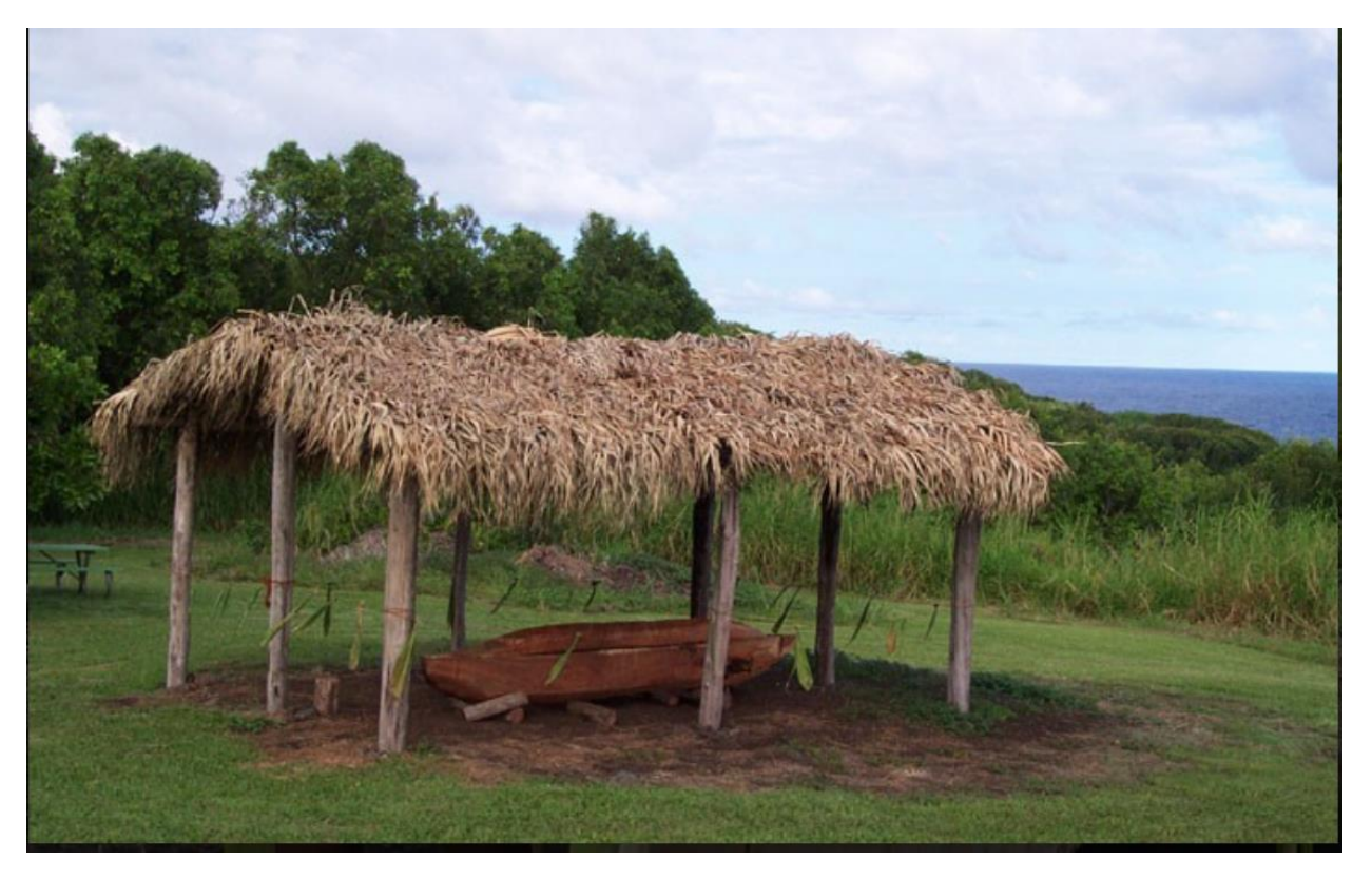
Walter's canoe underneath a traditional Hawaiian hale that was built specifically for the canoe's construction.