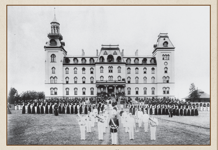
Iowa State College, 1890

asking him to become the Director of Agriculture at Tuskegee Institute in Alabama.