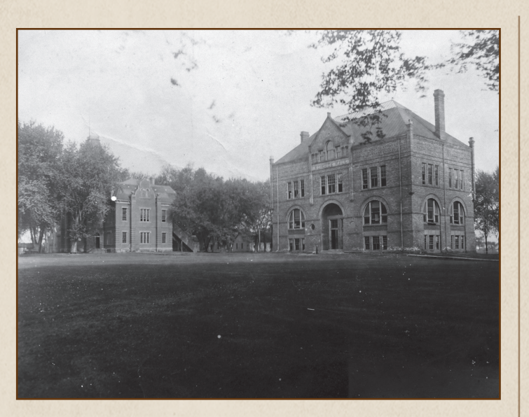
Simpson College, Indianola, IA

forgot their kindness. They continued to write letters to each other long after Carver graduated from college and moved to Tuskegee Institute in Alabama. He said, "You can't imagine how much good the reading of your letter did me…"