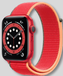
Red Apple Watch

*Apple Watch and Red iPhone 12 Mini are trademarks of Apple, Inc.