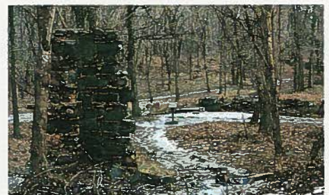
Partial remains of Matildaville.

1828 the Chesapeake and Ohio Canal Company bought the old Patowmack Canal and its rights and began construction of an ambitious canal system—a