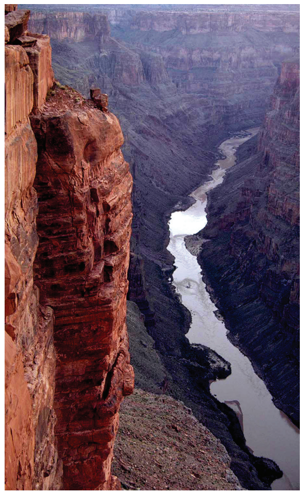
Toroweap Overlook in western Grand Canyon offers visitors a stunning view of the Colorado River.

The Colorado River flows 277 river miles (446 km) from Lees Ferry to the Grand Wash Cliffs, the accepted beginning and end of Grand Canyon. Hidden in the narrow Inner Gorge, the river is visible from only a few spots along the rim.