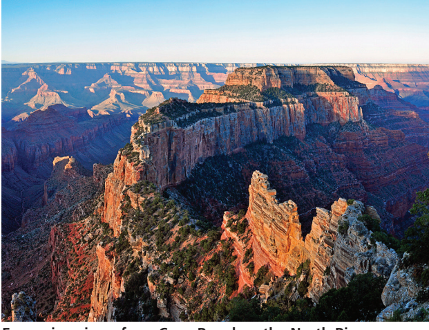
Expansive views from Cape Royal on the North Rim printed on 100% recycled paper 0919

The North Rim and the South Rim are only separated by ten miles (16 km) as the raven flies. Although it is not apparent, the north wall of the canyon rises a thousand feet (305 m) higher than the South Rim, giving the North Rim nearly twice the annual precipitation as South Rim. This considerable difference in elevation results from the fact that the apparently flat-lying rocks of the Kaibab Plateau are dipping gently to the south.