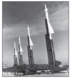
Nike missiles stand ready

All of us have felt fear at some time. During the 1950s, Cold War-era fears of Soviet long-range "Bear" bombers caused the U.S. Army to develop a weapon to destroy those planes. Nike anti-aircraft missiles were deployed across the country, including 11 sites protecting the Bay Area. Nike Site SF-51 included a control station atop Sweeney