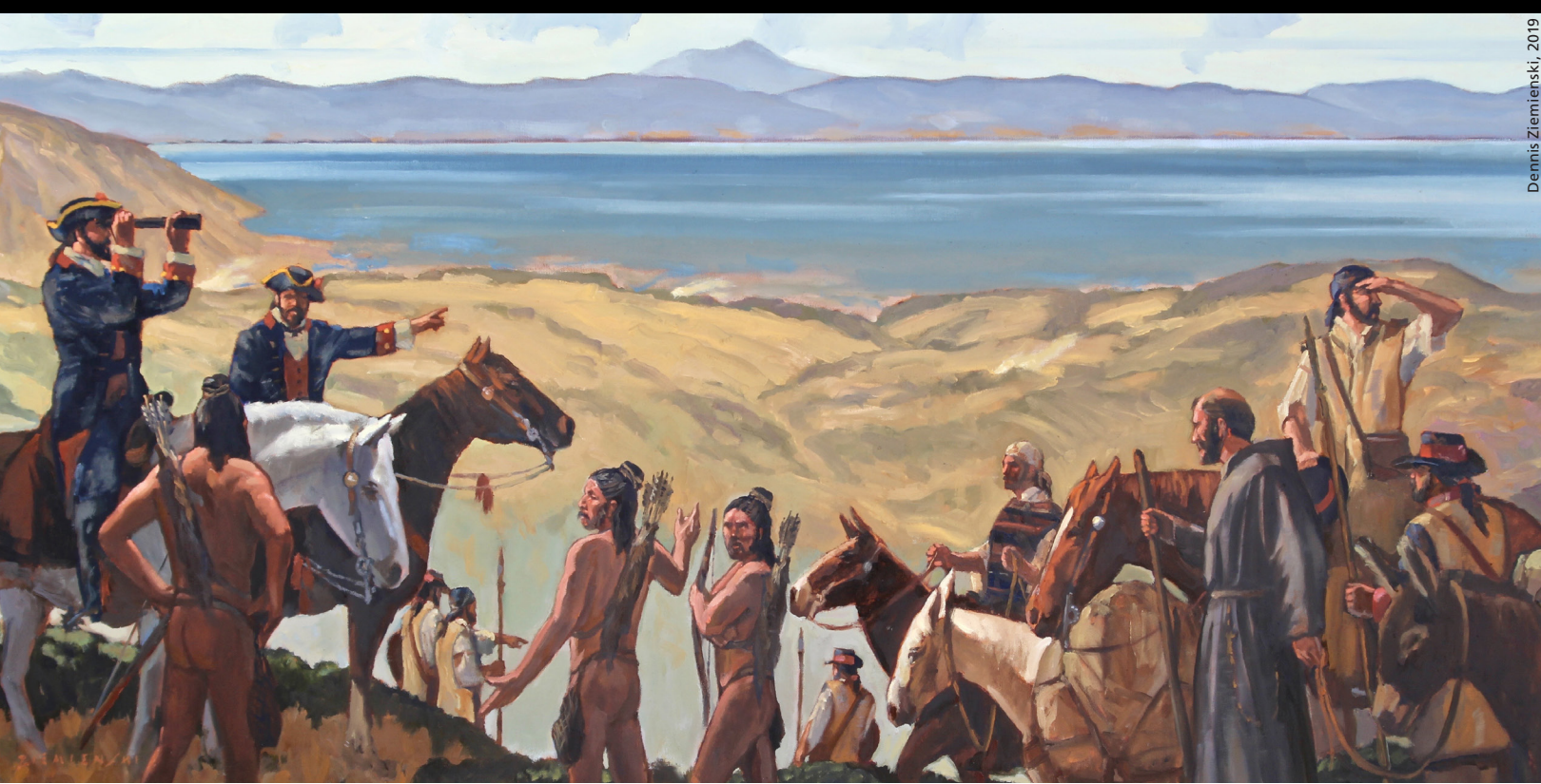
Ohlone and Portolá Expedition members view San Francisco Bay from Sweeney Ridge on November 4, 1769.