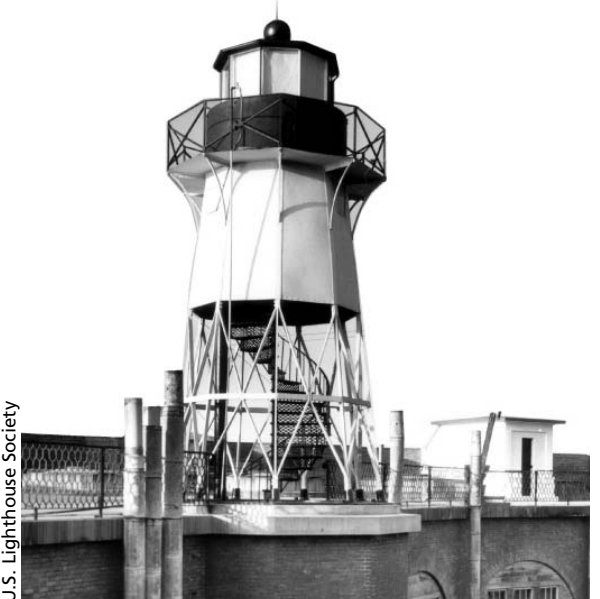
Third lighthouse, 1930s.