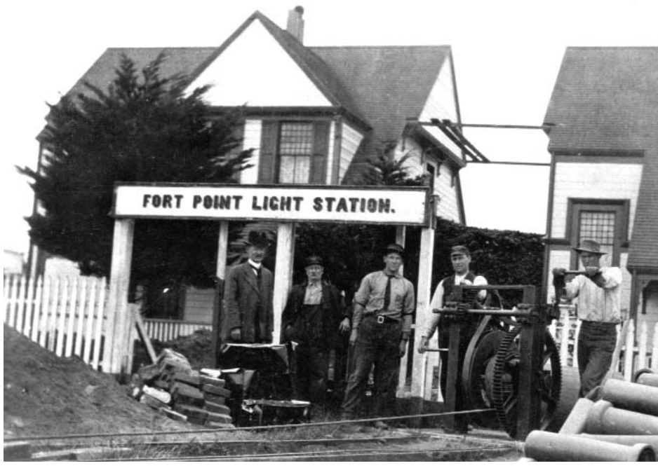
A hand-cranked tram lifted supplies to the keepers' houses.

Keepers often passed the time by reading, raising livestock, and gardening. Often the keeper's family lived at the site and helped with the duties. One of the first roles for women in government service was as lighthouse keepers. Fort Point had five female assistant keepers between 1860 and 1870.