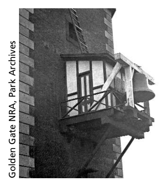
Fog bell on the side of the fort.

Lonely yet comforting, the sounds of fog horns bring a feeling of nostalgia to many San Franciscans. For those on ships negotiating the fog-shrouded Golden Gate, the fog signals meant security and safety. From the 1850s through 1904, a bell chimed from Fort Point when the fog was in. A clockwork mechanism rang the bell, and if the mechanism failed, the keepers or their spouses rang the bell manually, a task requiring them to risk their lives by climbing down a windswept ladder on the side of the fort only to stand below the fort's