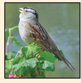
White-crowned Sparrow Oak, willow, scrub, grassland Common

All terrestrial habitats Common spring-fall