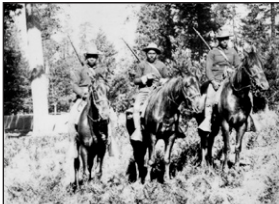
Members of the 24th Infantry on mounted patrol, Yosemite National Park, 1899.