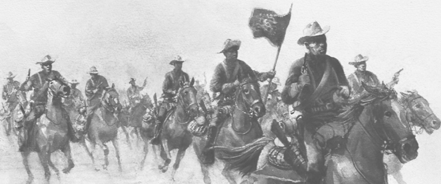
Painting courtesy Arthur Shilstone