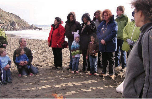
Left, Top & Bottom images: Traditional prayer led by a representative of the Coast Miwok at the annual Welcome Back Salmon ceremony at Muir Beach.