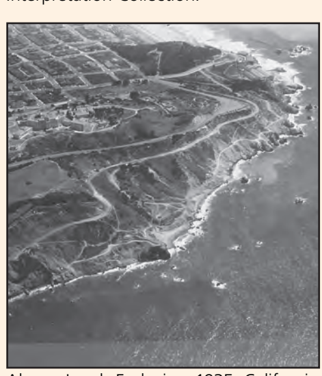
Above: Lands End, circa 1935.