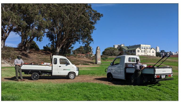
Grounds crew working with EV trucks in Fort Mason during Summer 2020

The Fort Mason Grounds crew is now sporting two electric utility vehicles. They acquired the first one in 2016 and got the chance to acquire another one in 2019. The two vehicles work internally around Fort Mason and can reach a maximum speed of 25 mph. Replacing two gasoline-fueled trucks, the new electric trucks are silent and can carry mulch, soil, wood chips and tools. The electric trucks represent a major shift for operations, as well as an overall emission cut from our off-road fleet. They are safest for the operator and for the environment. They even have heating! The trucks are charged with a regular plug during the night and can work up to 12 hours with one charge.