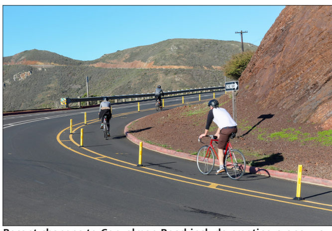
Recent changes to Conzelman Road include creating a one-way flow for cars downhill, adding parking, and creating a wider, protected uphill bike lane

The biggest change has been to create a one-way flow for cars downhill on Conzelman Road, which allows for extra parking to view the stunning vistas. This has also allowed for a wider, protected uphill bike lane that was designed and installed in collaboration with the local biking community. These efforts are part of a larger plan to encourage biking and make it safer throughout the Marin Headlands. The next project will focus on the interchange with Hwy 101 and Alexander Avenue, a high-traffic area that is very popular with both commuter and rental bikers.