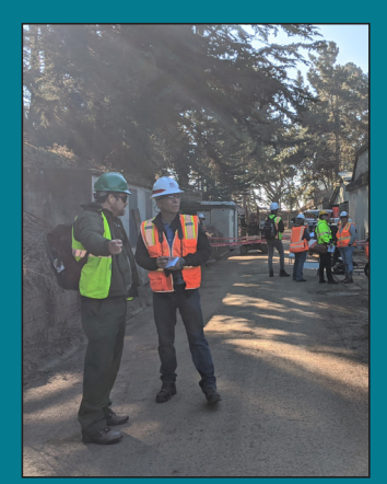
Park staff working at the Trails shop in Fort Miley to achieve environmental compliance