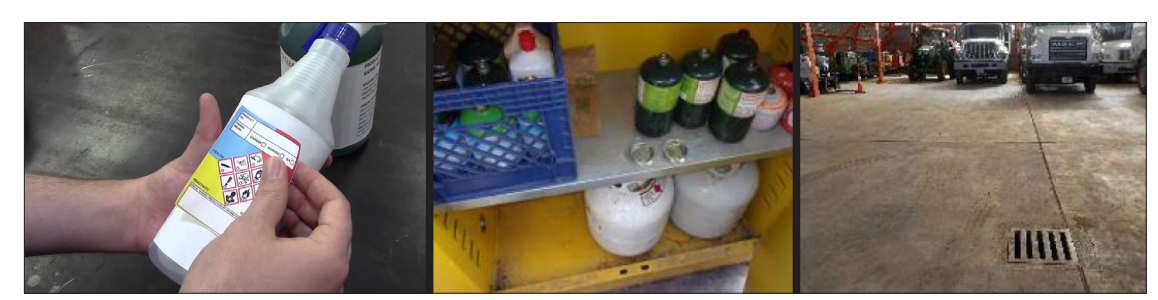
Environmental auditors want to ensure that Globally Harmonized System (GHS) labels are on secondary chemical containers, flammable materials are kept in flammable lockers, and that proper spill containment is in place

The audit resulted in a list of findings that ranged from minor issues such as unlabeled containers and handling of universal and hazardous waste, to more long-term programmatic findings involving water and wastewater compliance. A dedicated team of park staff will be working to correct these findings before the next audit is held 5 years from now.