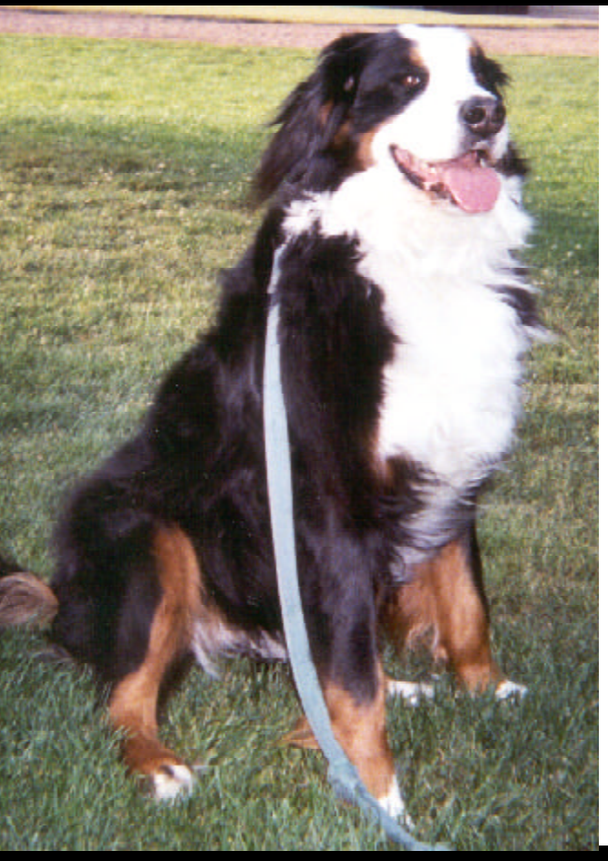
"Enjoy your neighborhood park today!"