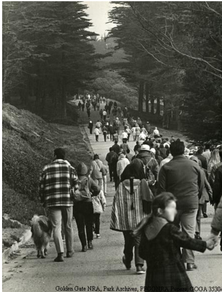
Golden Gate NRA, Park Archives, PFGGNRA Papers, GOGA 35304

Golden Gate National Recreation Area Park Archives and Records Center Building 201, Fort Mason San Francisco, CA 94123 Phone: 415-561-2807 Fax: 415-441-1618