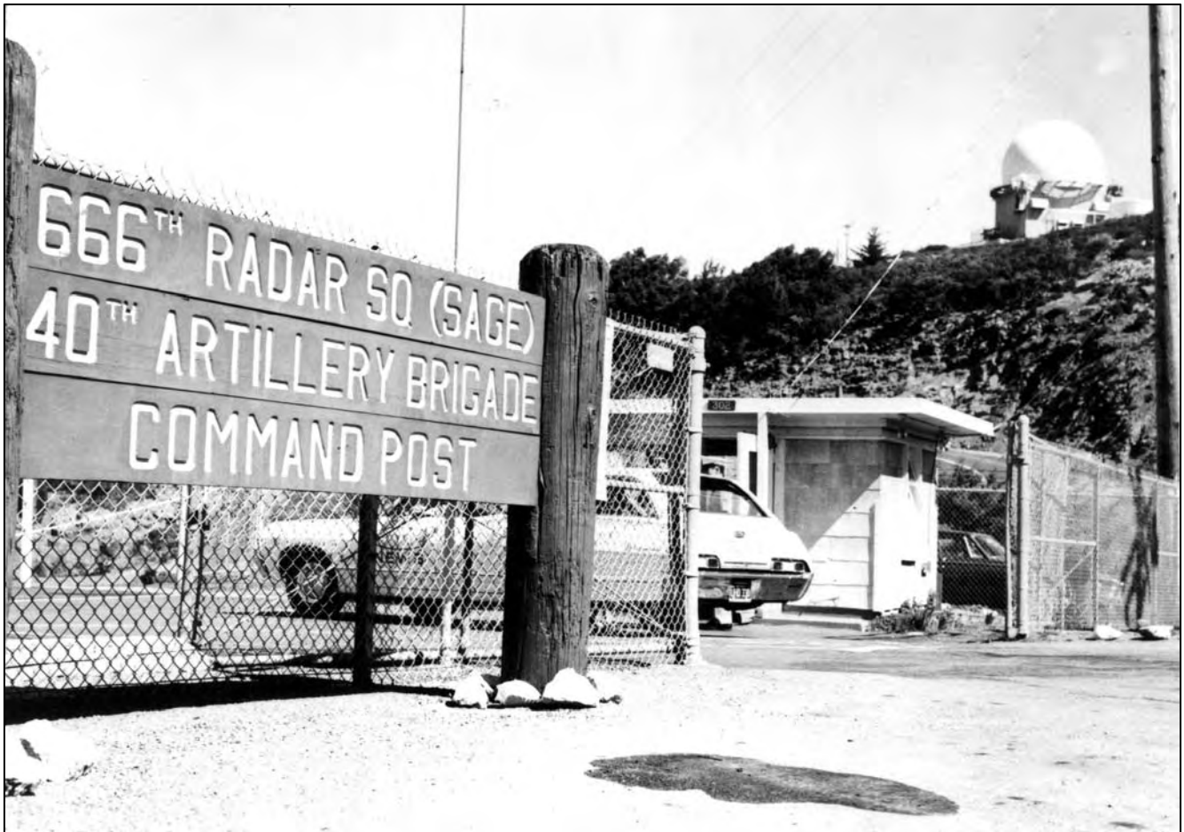
The entrance to the Mill Valley Air Force Station on Mt. Tamalpais, clearly indicates that the facility was shared by the Air Force's Radar Squadron and the Army's Air Defense Command Post.