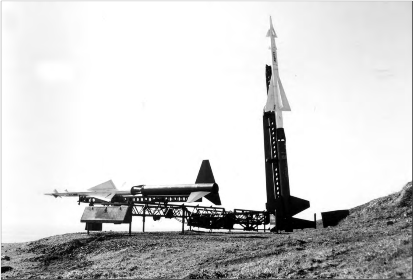
Temporary launching section of Nike-Ajax missiles assigned to Battery A, 9 th AAA, Fort Barry, 1955. This view clearly illustrates the exposed nature of the field emplacement.