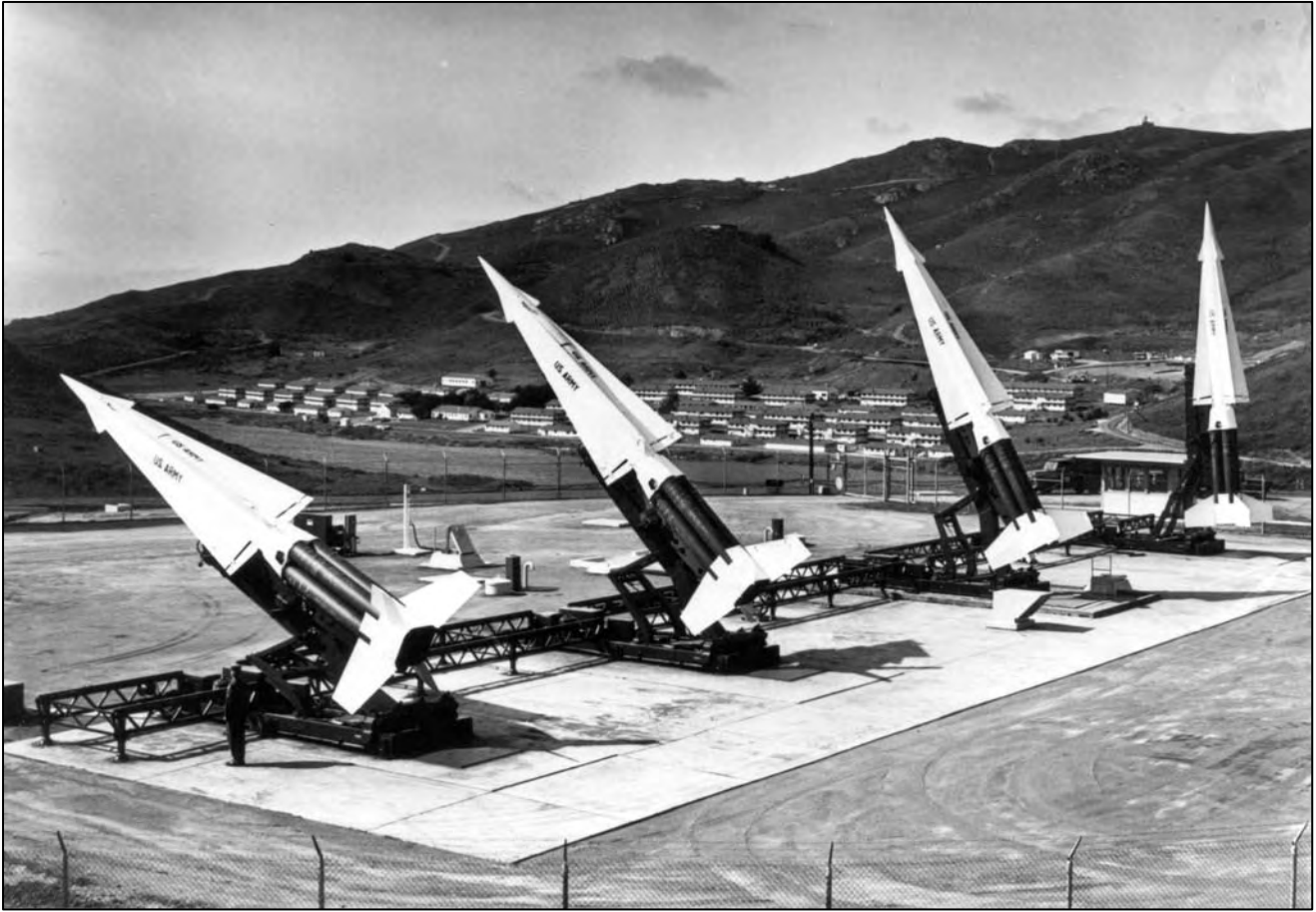
“A” Section at SF-88L, circa 1959. The four Nike Hercules missiles are arrayed for the photographer’s benefit, in a non-launching configuration. The cantonment of Fort Cronkhite is visible across the lagoon. This famous view of SF-88L was used time and time again to illustrate the Nike missile defenses of the Bay Area.