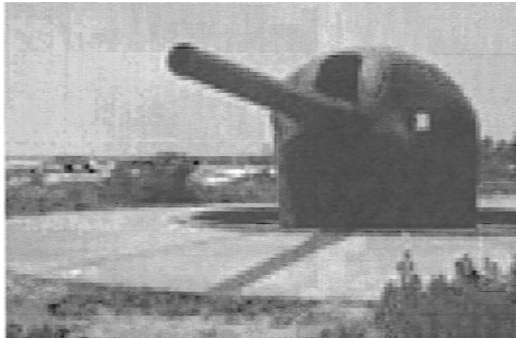
Fig. 7.2: Photograph of a 6-inch gun, thought to be at Milagra Ridge.

covering land all the way up to the fences of the launch site. The furrows from this farming activity still exist. It is recommended that further research be undertaken to find out who the farmers were, what kind of relationship they had with the Army and when this artichoke growing began and when it ended.