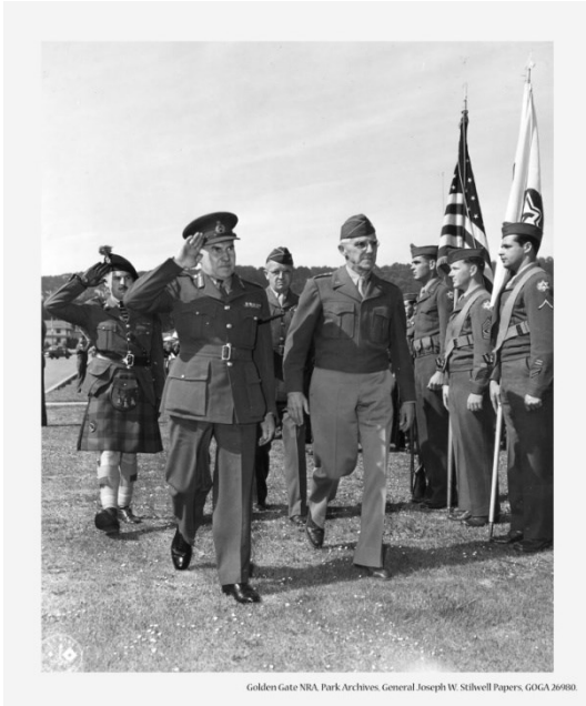
Golden Gate NRA, Park Archives, General Joseph W. Stilwell Papers, GOGA 26980.

from a cartoon drawn by one of his students. From 1935 to 1939 he served as the military attaché to the U.S. Legation in Beijing, followed quickly by an assignment with the 2 nd Infantry Division and then the 7 th Infantry Division at Fort Ord, California; here he was awarded the softer nickname of “Uncle Joe” for his intimate leadership style.