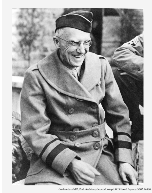
Golden Gate NRA, Park Archives, General Joseph W. Stilwell Papers, GOGA 26980.

Golden Gate National Recreation Area ATTN: Park Archives and Records Center Building 201, Fort Mason San Francisco, CA 94123 [Mailing Address]