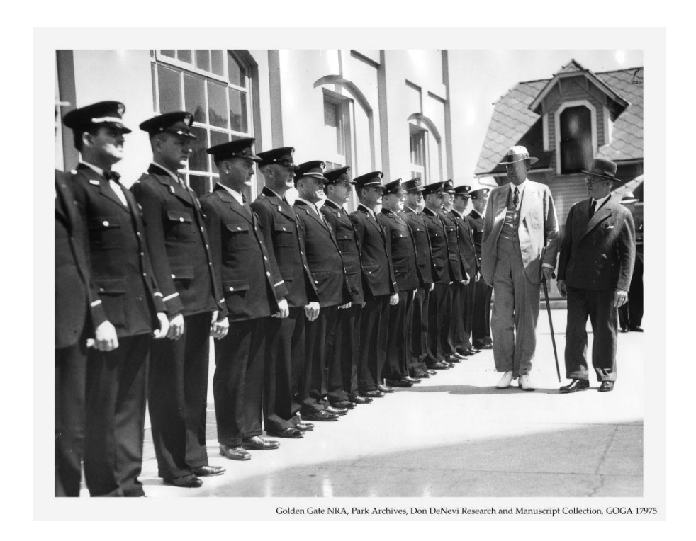
[See the Item List in Appendix 1 for a comprehensive inventory of the collection]