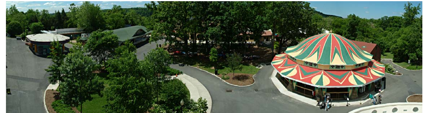
For well over one hundred years Glen Echo Park has been delighting the people who come to study, to play, and to enjoy the park's own special charms. Let's stroll through Glen Echo Park's memories, and then see what the Park is offering you, your family, and your neighbors